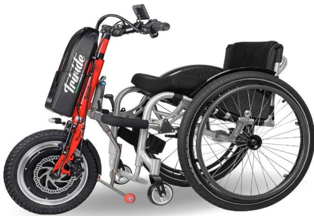
14 " wheel with integrated motor